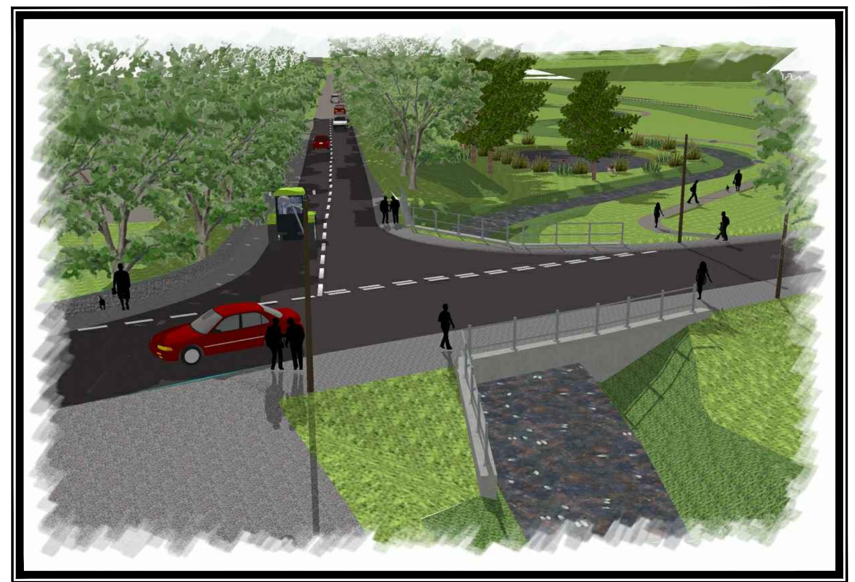
Artists Impression No.3