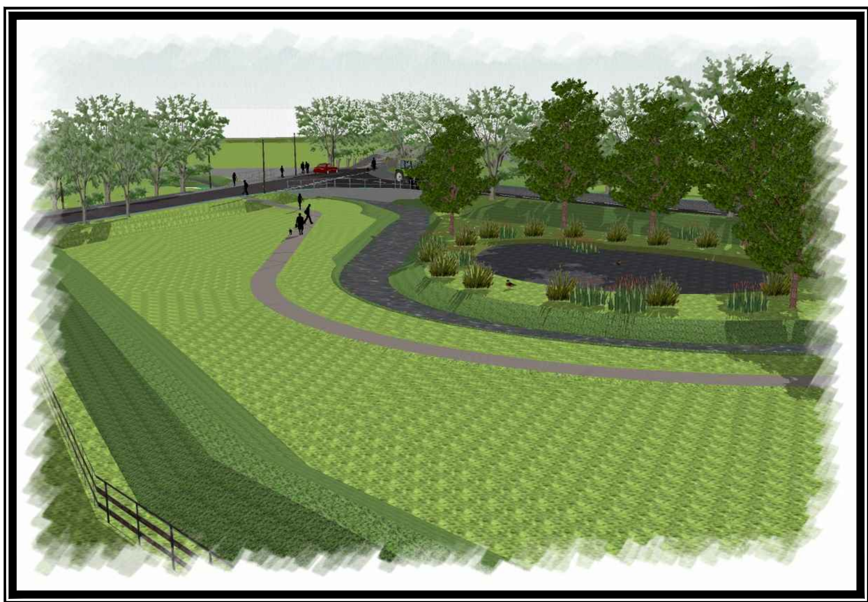
Artists Impression No.2