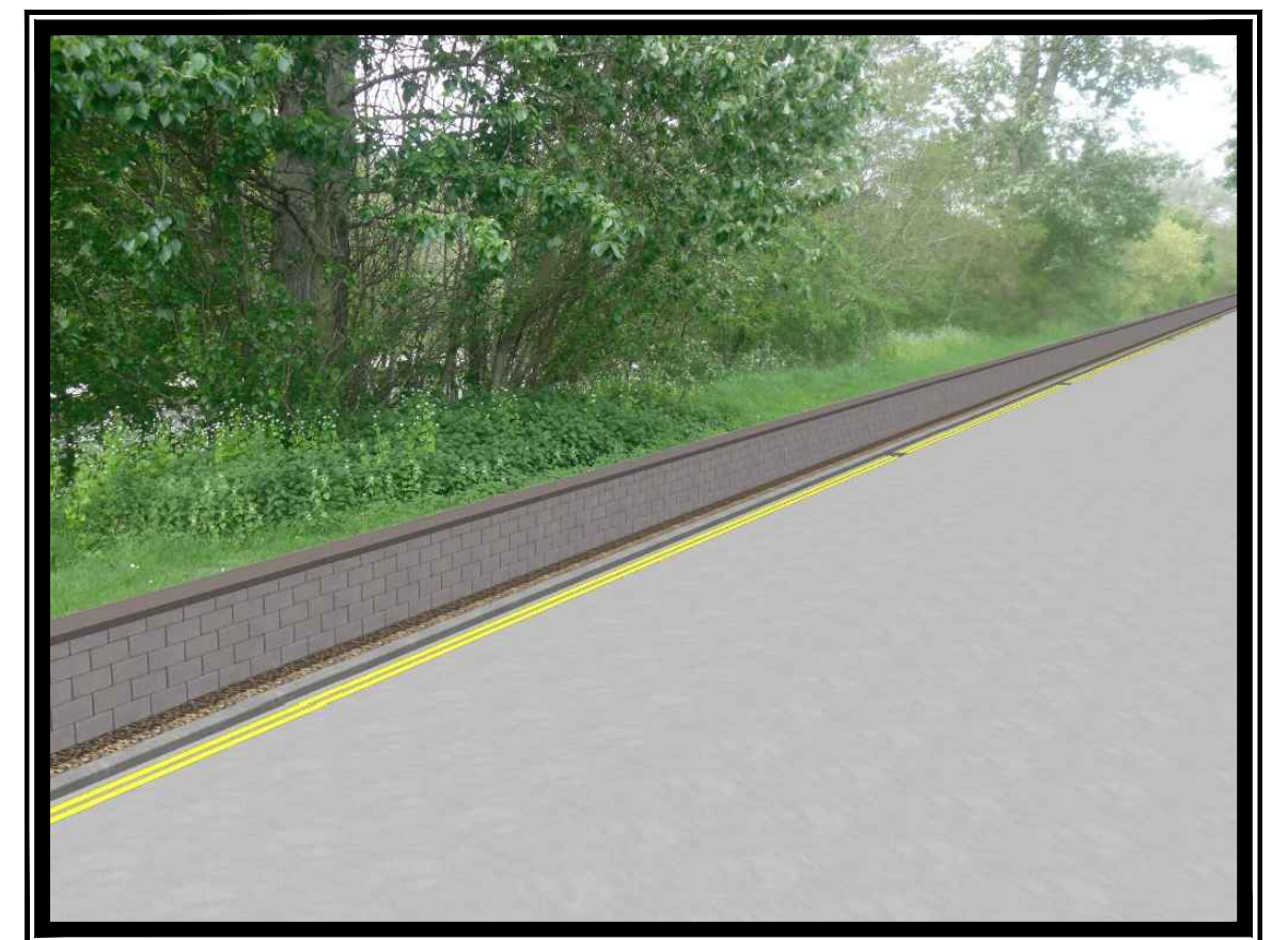
Photo 4b Proposed