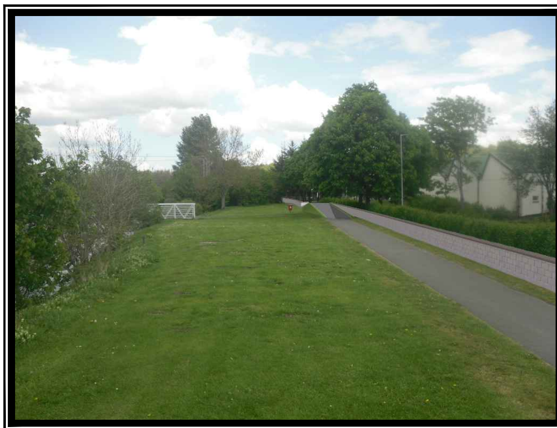
Photo 3b Proposed